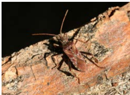
Figure 1: Western conifer seed bug.

Members of the leaffooted bug family, they eat seeds and do not bite people. They enter homes in search of warm, protected sites to overwinter. This habit is shared by many other insects, such as