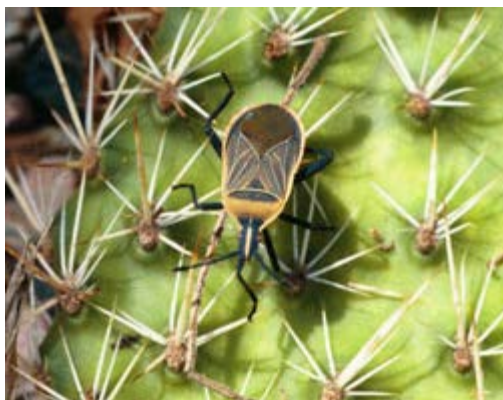
Figure 6: Opuntia bug.