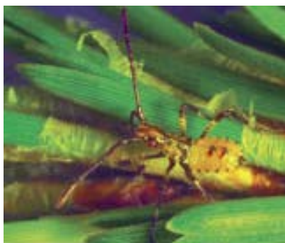
Figure 4: Conifer seed bug nymph.