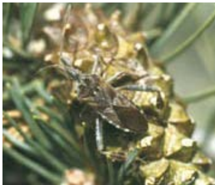
Figure 3: Western conifer seed bug.